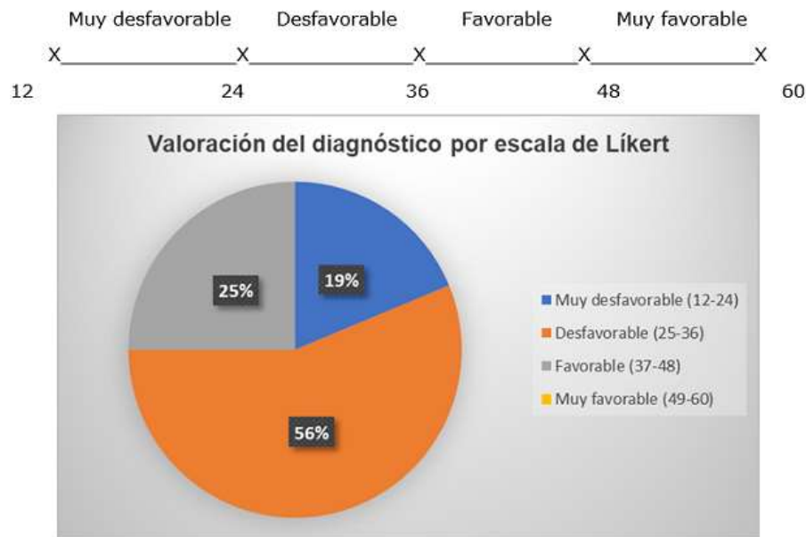
Fig. 1 - First results of the diagnostic (Likert scale)

The results achieved in the first round to evaluate the knowledge of each instructor (Figure 1) showed that none of them were within the Very Favorable range, four were Favorable, nine Unfavorable, and three Very Unfavorable. As can be observed, most instructors (56 %) qualified in the Unfavorable category, so it can be inferred that there is a cognitive limitation to performing quality physical and therapeutic strength training activity properly in private gyms.